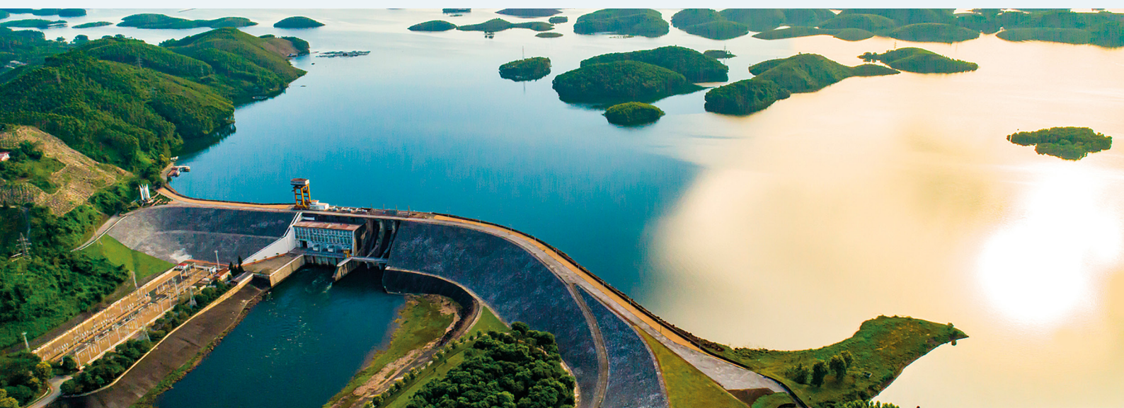
REE's Thac Ba Hydropower Plant