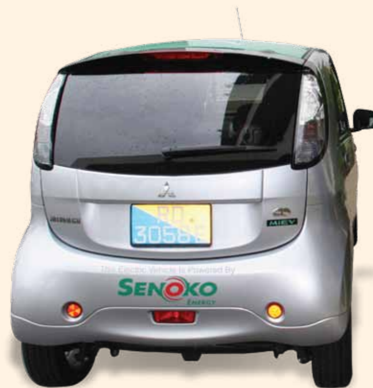
Mitsubishi Innovative Electric Vehicle (i-MiEV).