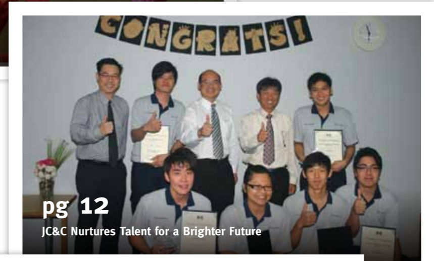
pg 12 JC&C Nurtures Talent for a Brighter Future