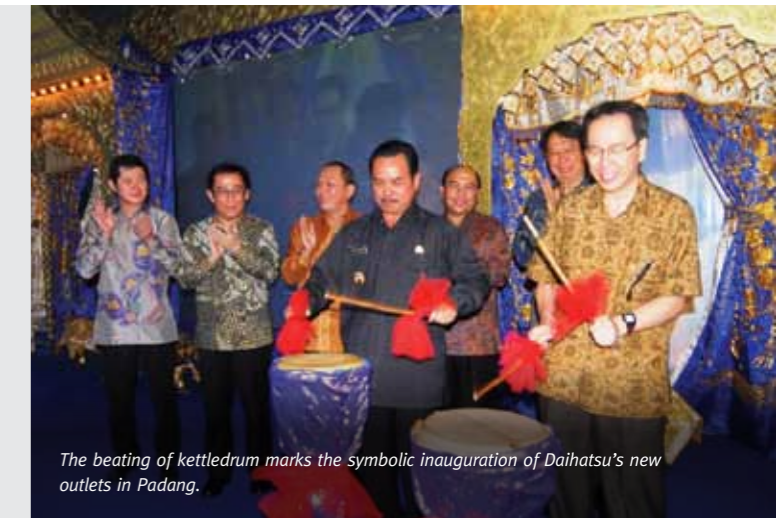
The beating of kettledrum marks the symbolic inauguration of Daihatsu's new outlets in Padang.