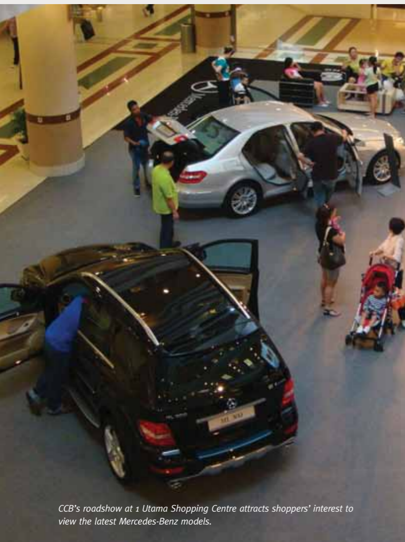
CCB's roadshow at 1 Utama Shopping Centre attracts shoppers' interest to view the latest Mercedes-Benz models.