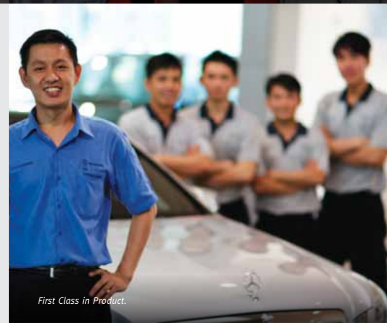
First Class in Product.

With the implementation of this First Class philosophy, C&C seeks to forge a cohesive work environment in which each staff is regarded as a first class team member and an esteemed business partner that is set to propel the company to new heights.