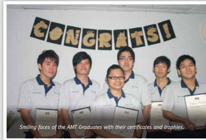
Smiling faces of the AMT Graduates with their certificates and trophies.

Graduates had to undergo a one-year programme that included intensive classroom and workshop training, as well as practical and theory exams. However, their hard work paid off and they are now ready to put their knowledge and skills into greater practice. It is also a testament of the trainees' diligence and commitment towards continuous learning and upgrading to better their technical competence and expertise.