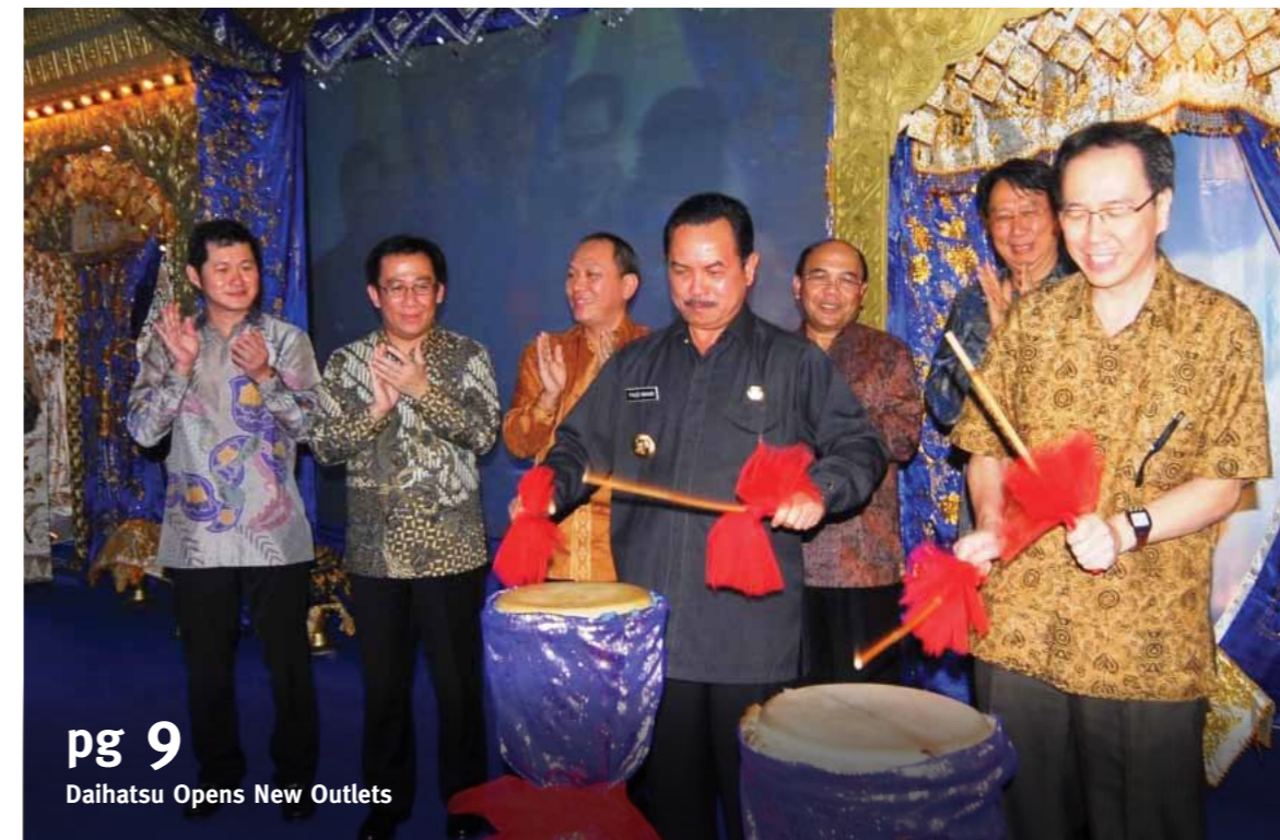
pg 9 Daihatsu Opens New Outlets