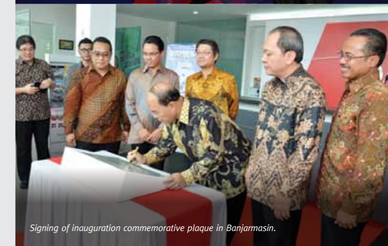
Signing of inauguration commemorative plaque in Banjarmasin.