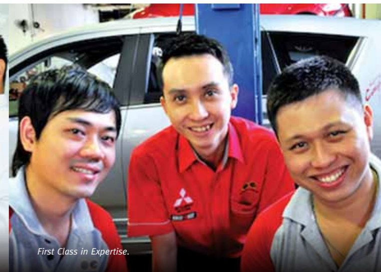
First Class in Expertise.