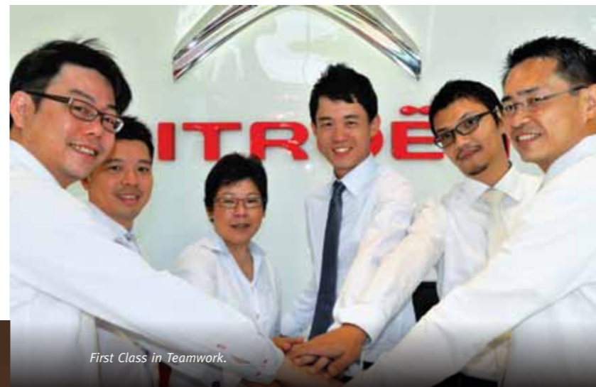
First Class in Teamwork.