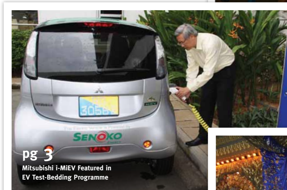
pg 3 Mitsubishi i-MiEV Featured in EV Test-Bedding Programme