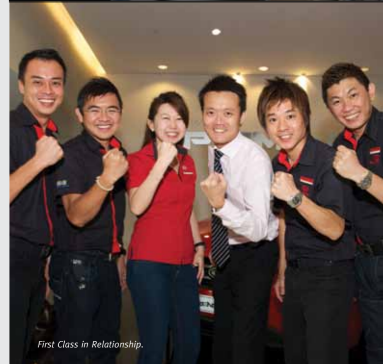
First Class in Relationship.